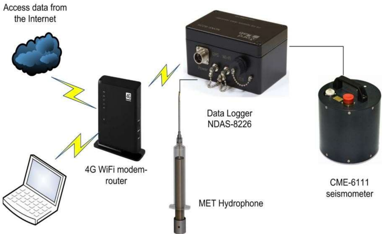
Seismic monitoring equipment

A 4G modem-router is used to provide remote access and control of the equipment operation – it allows controlling the system over the Internet. The modem-router is connected to NDAS-RT via a WiFi-connection. The system is powered by a 12 V power source with an external battery – this guarantees the equipment operation in case of power failure.