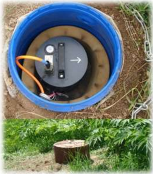
Seismometer installation for seismic observations