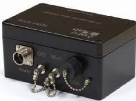
Data logger NDAS-8226

In June 2018, a molecular-electronic broadband seismometer CME-6111 was installed. This is a precision seismometer having a frequency range of 0.016 Hz (60 csec) – 50 Hz, a low self-noise level, high linearity and wide bandwidth. The presence of force feedback ensures high time and temperature stability of the parameters.